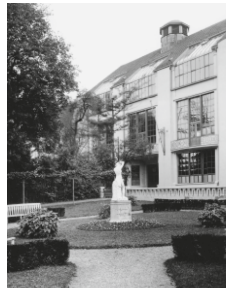
Bauhaus-Universität Weimar, formerly Grand Ducal Art School Geschwister-Scholl-Straße 8 99423 Weimar www.uni-weimar.de