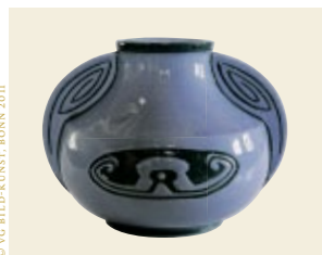
Keramik-Museum Bürgel Am Kirchplatz 2 07616 Bürgel www.keramik-museum-buergel.de