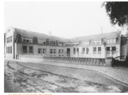
Bauhaus-Universität Weimar, formerly Grand Ducal School of Arts and Crafts Geschwister-Scholl-Straße 7 99423 Weimar www.uni-weimar.de