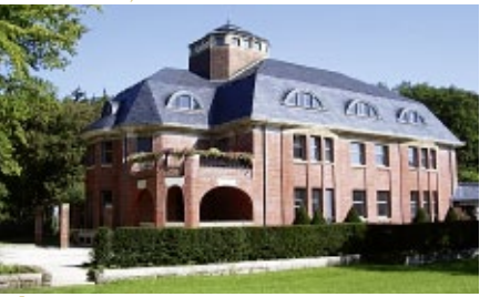
Haus Schulenburg Gera Straße des Friedens 120 07545 Gera www.haus-schulenburg-gera.de The house and exhibitions are open to visitors all year round