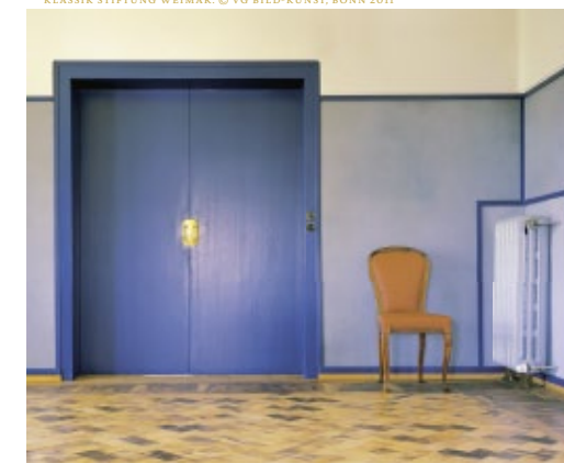
House "Hohe Pappeln" Belvederer Allee 58 99425 Weimar www.klassik-stiftung.de