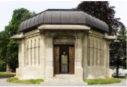
Ernst Abbe monument Carl-Zeiß-Platz 07743 Jena www.jena.de