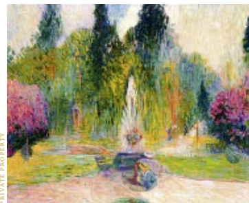
Kunsthaus Apolda Avantgarde Bahnhofstraße 42 99510 Apolda www.kunsthausapolda.de